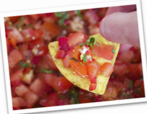
Mexican food is a big part of any Mexican celebration.

In the United States, celebrations are varied. This means they are celebrated differently in different locations. Schools hold special events to teach students about the importance of this day in history. People hold large gatherings to celebrate Mexican culture, especially the music and dancing. Stores and industries hold special sale events. Families and friends gather to enjoy Mexican food and drinks. Children dance and play with piñatas.