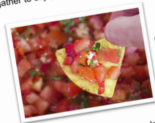
Mexican food is a big part of any Mexican celebration.

In the United States, celebrations are varied. Schools hold special events to educate students about the historical significance of this day. People hold large gatherings to celebrate Mexican culture, especially the music and dancing. Stores and industries hold special sale events and advertise Mexican products and services. Families and friends gather to enjoy Mexican food and drinks. Children dance and play with piñatas.