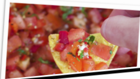
Mexican food is a big part of any Mexican celebration.

In the United States, celebrations are varied, so they are celebrated differently in different locations. Schools hold special events to educate students about the historical significance of this day. People hold large gatherings to celebrate Mexican culture, especially the music and dancing. Stores and industries hold special sale events and offer Mexican products and services. Families and friends gather to enjoy Mexican food and drinks. Children dance and play with piñatas.